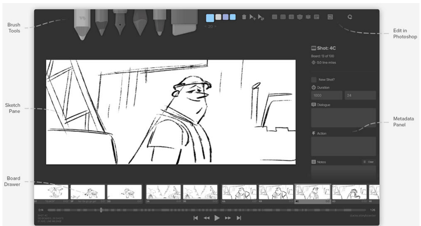
Ксєнус 2 Белое Золото Коды

This runs on all 3 major operating systems and it's 100% free to download and use forever.. One of their coolest projects is Storyboarder, a free app made for visualizing stories.. The entertainment industry needs quality storyboard artists and those artists need great software. Easy Lingo For Windows 10